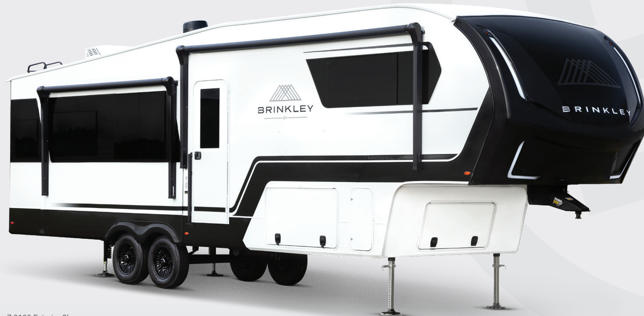
Z 3100 Exterior Shown