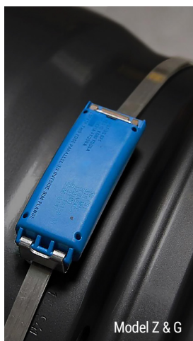
Model Z & G