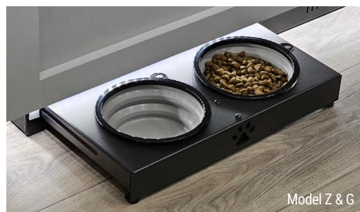
Model Z & G