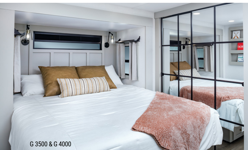
G 3500 & G 4000