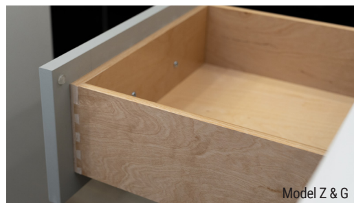
Model Z & G