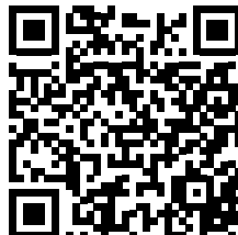
Model Z AIR Owner's Hub

Copyright © 2026, Brinkley RV. No part of this publication may be reproduced, distributed, or transmitted in any form or by any means, including photocopying, recording, or other electronic or mechanical methods, without the prior written permission of the publisher, except as permitted by U.S. copyright law.