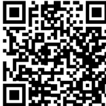
Model Z Owner's Hub

Copyright © 2025, Brinkley RV. No part of this publication may be reproduced, distributed, or transmitted in any form or by any means, including photocopying, recording, or other electronic or mechanical methods, without the prior written permission of the publisher, except as permitted by U.S. copyright law.